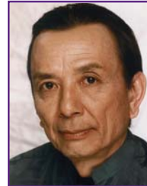
Actor James Hong. American Masters: Hollywood Chinese .

AMERICAN MASTERS: HOLLYWOOD CHINESE — From the first Chinese-American film produced in 1916 to Ang Lee's triumphant Brokeback Mountain nine decades later, a documentary