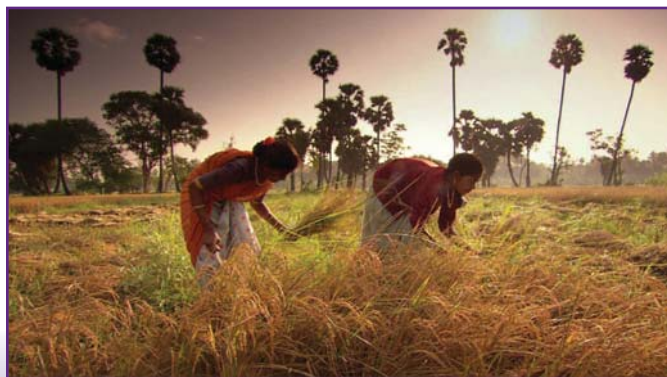
Women harvesting. The Story of India.