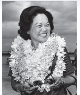
U.S. Representative Patsy Mink (D-HI)

In 1965, Patsy Mink became the first Asian-American woman and woman of color in the U.S. Congress. Seven years later, she ran for the presidency and co-authored Title IX, the landmark legislation that opened up higher education and athletics to America's women.