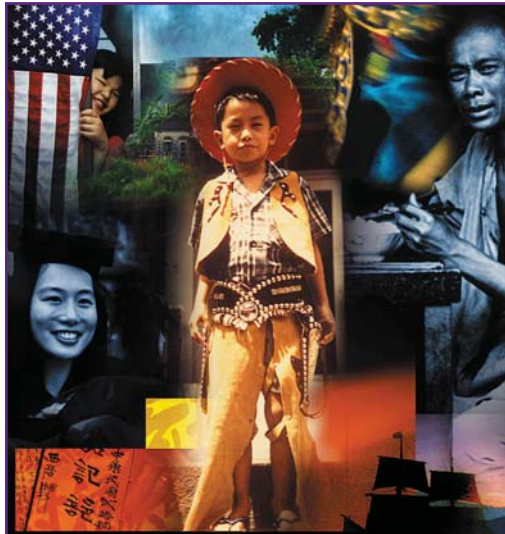
Becoming American . Courtesy Public Affairs Television

THE STORY OF INDIA — Part 6 of 6. Freedom . Michael Wood examines the time of the British occupation of India — the Raj — and India's struggle for freedom. Wood relates how the British East India Company came to control much of the Indian subcontinent and recounts the rise of the Indian freedom movement, spotlighting Gandhi and Nehru and exploring the fateful events that led to the partition of India in 1947. {DVI} Repeats Wed 5/27, 4pm