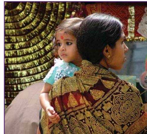
Mother and child in Patna. The Story of India.

Friday, May 15 • 10:00 p.m. THE STORY OF INDIA — Part 3 of 6. Spice Routes and Silk Roads. Michael Wood explores the history of India in the days of the Roman Empire. In Kerala, the spice trade opened India to the world — Wood takes one of the great old sailing boats that still cross the Indian Ocean carrying pepper and cloves. Moving north, Wood takes the Silk Road from the deserts of Turkmenistan through the