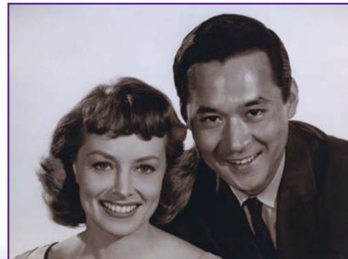
Victoria Shaw and James Shigeta. The Slanted Screen .

THE SLANTED SCREEN — Through a parade of interviews and 50 film clips spanning a century, a documentary explores portrayals of Asian men in American cinema, chronicling the experiences of actors who have had to struggle against stereotyping.