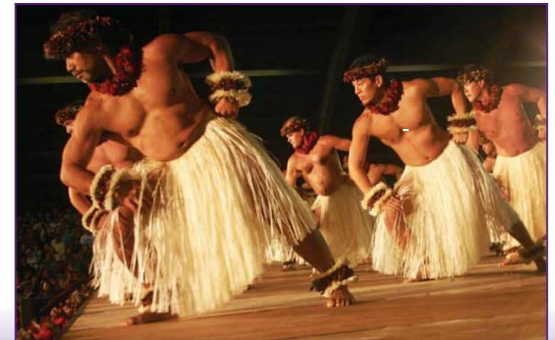
INDEPENDENT LENS Na Kamalei: The Men of Hula.

Friday, May 15 • 11:00 p.m. THE STORY OF INDIA — Part 4 of 6. Ages of Gold. Reaching the time of the Fall of Rome in the West, Michael Wood spotlights the achievements of India's golden age from 300 to 1000 AD. In the south, he visits the giant temple of Tanjore, meets the current "Senior Prince" and watches traditional bronze casters, working as their ancestors did 1,000 years ago. Wood shows how the Middle Ages laid the social and imaginative foundations of today's India. {DVI} Repeats Mon 5/18, 1pm; Wed 5/20, 4pm