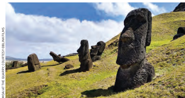
NOVA AT THE QUARRY

Science series NOVA spotlights the iconic monoliths of the remote Pacific island of Rapa Nui (Easter Island). How were the giant stone heads carved and raised, why, and by whom? In Easter Island Origins , learn about a new generation of researchers overturning old theories to reveal the rich history, innovation and resilience of the Rapa Nui people, and uncovering new evidence about where they — and their stone building practices — came from. Also on NOVA this month, Building the Eiffel Tower (Feb. 14) explores the revolutionary engineering behind Paris's iconic iron landmark, completed in just over two years for the 1889 World's Fair and ushering in a new age of global construction. Then, in Hunt for the Oldest DNA (Feb. 21) follow the dramatic quest to recover DNA millions of years old and reveal a lost world from before the last Ice Age. For decades, scientists have tried to unlock the secrets of ancient DNA, and one maverick had an idea about a new place to look.