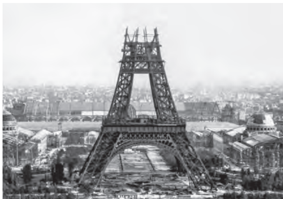
PARIS, 1888.

Wednesday, February 14 at 9 p.m. on WETA PBS & WETA Metro NOVA: Building the Eiffel Tower explores the engineering behind the construction of the famed Paris landmark, completed in 1889.