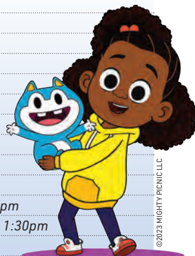
Lyla in the Loop