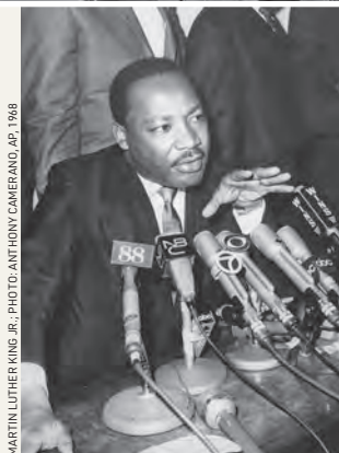
MARTIN LUTHER KING JR.; PHOTO: ANTHONY CAMERANO, AP, 1968

F ollowing WETA's Martin Luther King Jr. Day marathon airing of Eyes on the Prize , Series 1, the iconic history film on race in America and the Civil Rights Movement, this month WETA World reprises Series 1 (starting Feb. 1) and also presents Series 2 (starting Feb. 22). Series 1's six episodes cover 1954-1965; and Series 2's eight episodes explore the years 1965-1985, chronicling the movement in the period from the emergence of Malcolm X to the election of Harold Washington as the first African American mayor of Chicago. The late Julian Bond, political leader and civil rights activist, narrates. Eyes on the Prize won six Emmy Awards, the duPont-Columbia Gold Baton Award and two Peabody Awards, and it was nominated for an Academy Award.