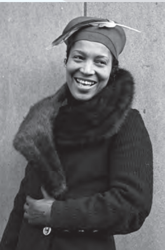
YALE UNIVERSITY LIBRARY, NOVEMBER 1934

Stream at weta.org/livestream or via the PBS App