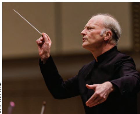
Maestro Gianandrea Noseda

I n February, the National Symphony Orchestra will be touring Europe, and among the stops along the way, Music Director Gianandrea Noseda will bring the NSO to his home city, Milan, for a performance at the Teatro alla Scala on February 26. In honor of this musical homecoming, WETA Classical’s NSO Showcase this month features the NSO performing two Italian favorites by Respighi: Trittico Botticelliano and Fontane di Roma . The February program also pays tribute to the portion of the tour in Germany with a performance of Schumann’s “ Rhenish ” Symphony — and takes a musical side trip with Borodin’s Polovtsian Dances . Stream the program all month at wetaclassical.org . Hear concert performances by the orchestra on the WETA Classical program NSO Showcase at 9 p.m. on the first Wednesday of each month.